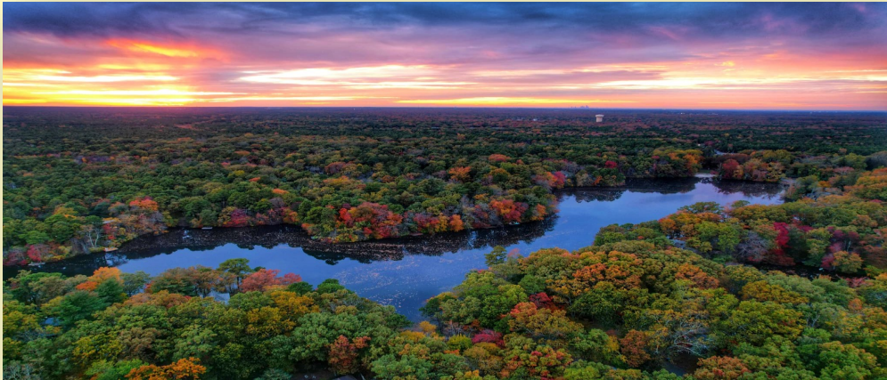
Above Photo—Aerial of Lake Pine in the Fall by Matt Diener

(*please check the Twp. website & official Face- book page for more details & updates)