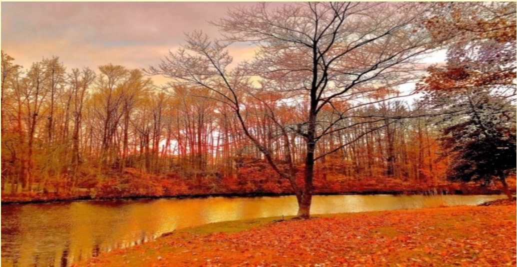
Above Photo—Fall in Medford

(*please check the Twp. website or Facebook page for updates during the COVID-19 restrictions)