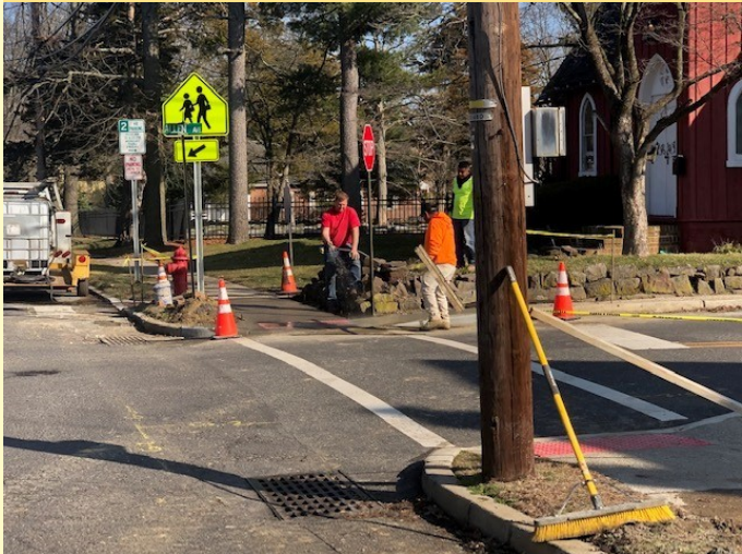
Photos of current sidewalk & curb cuts improvement work on Union St. under the Twp.'s Annual Road Program.

It is also responsibility of property owners to keep the sidewalk clear of debris, snow and ice. The property owner must be prompt in the cleaning and clearing of sidewalk to prevent pedestrian injury. This will also prolong the life of the sidewalk.